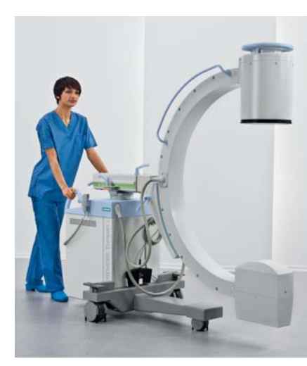
Maneuvering the C-arm is facilitated through consistent ergonomic design